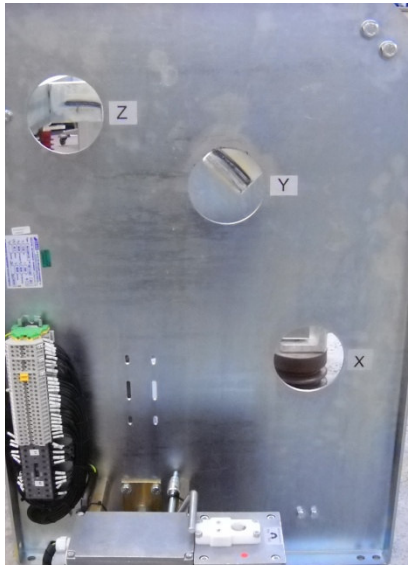
MI-COMP-CI3PZ 17,5kV 1600A + Motor M