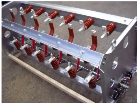
MI-CI3 17,5kV 400A 6P + Motor M