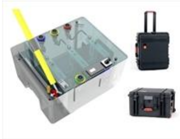
Mobile case with build-in earth switch MTI 12kV 40kA/1s