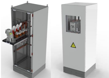
IC-cabinet 3.6kV 1000A 1IN + 1OUT